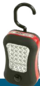
WERKSTÄTTLICHTE 2IN1 (BLISTER)