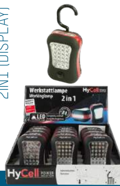
WERKSTÄTTLICHTE 2IN1 (DISPLAY)