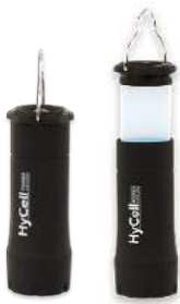
CAMPINGLAMPE 2IN1 (BLISTER)