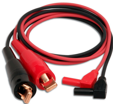
LSC-MBTLA2 (standard on MBT-LA2)