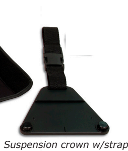
Suspension crown w/strap