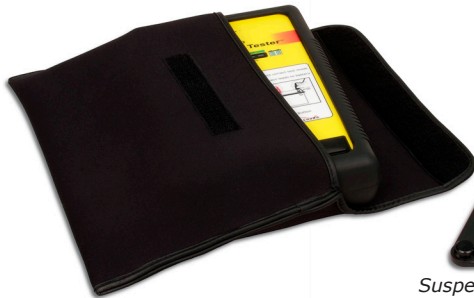
Soft case (tester not included)