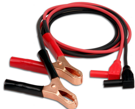
LSP-MBTLA2 (ideal for large batteries)